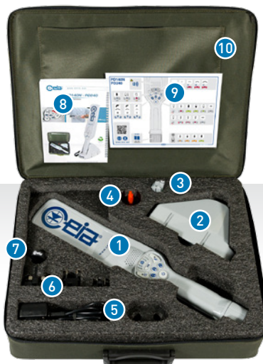
PD240 Set inside the Carry Bag