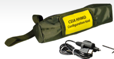
HHMD Configuration tool