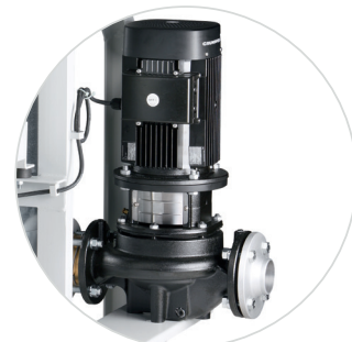
Heavy duty centrifugal pump