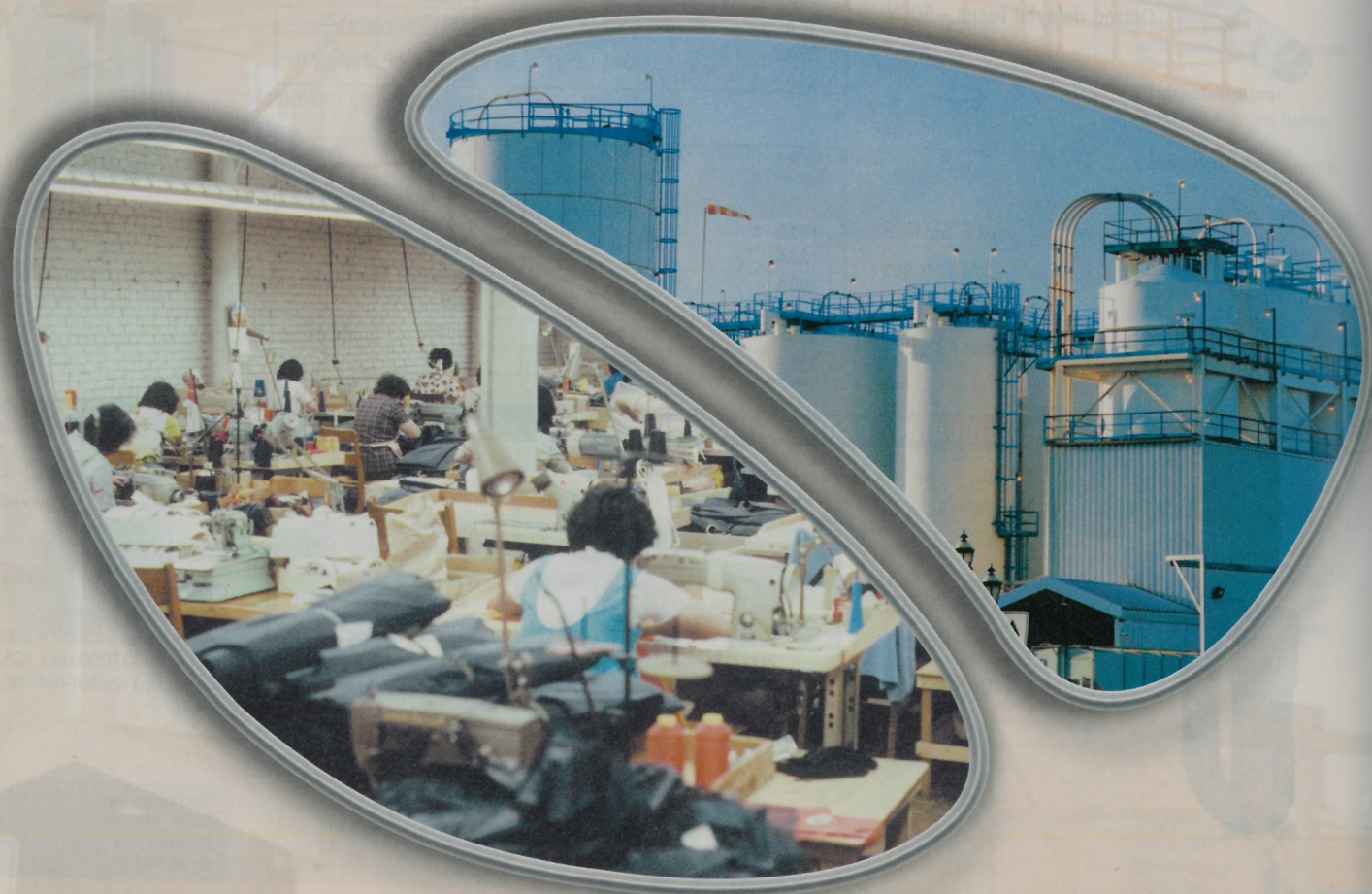
Large industrial plant.